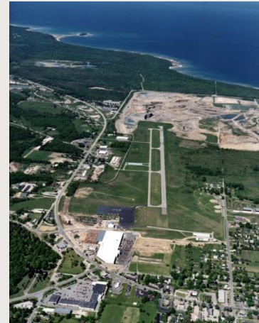
Dust – Gravel Extraction