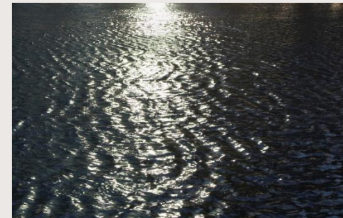
Glare – Body of Water