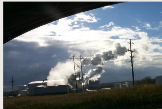
Steam Emissions – Industrial