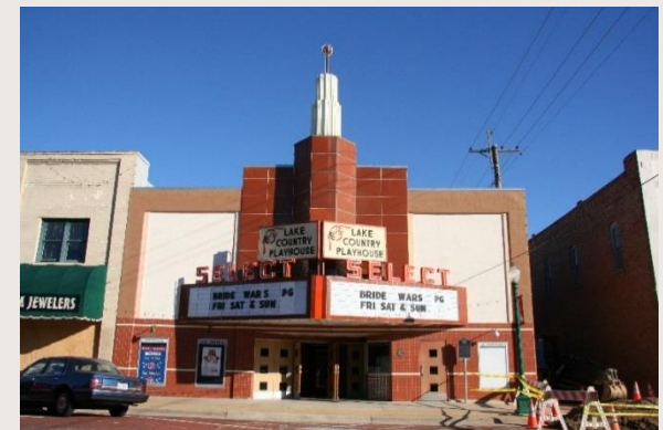
Special Use - Theater